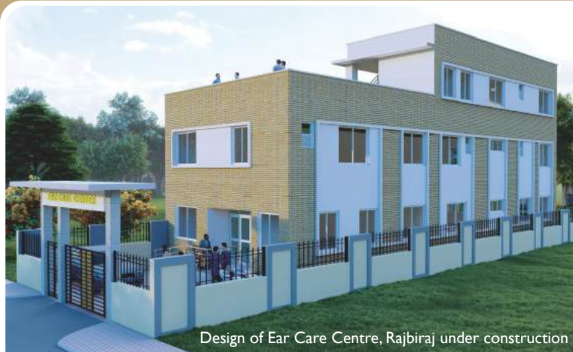
Design of Ear Care Centre, Rajbiraj under construction